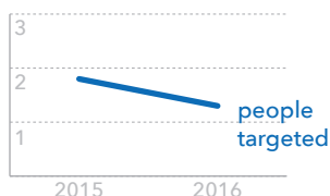
Affected people in million