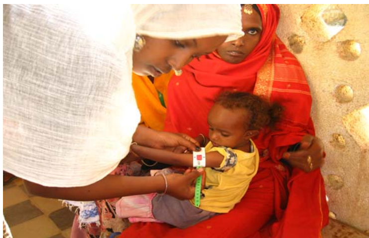
MUAC measurement by a community volunteer