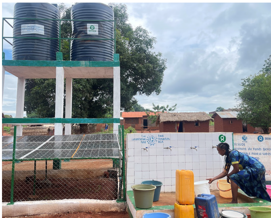
Photo: The new water infrastructure.